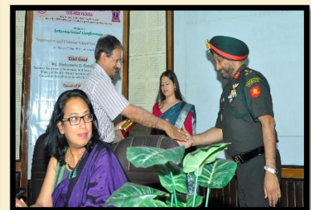
Lamp lighting by the guests and Felicitation of Dignitaries.