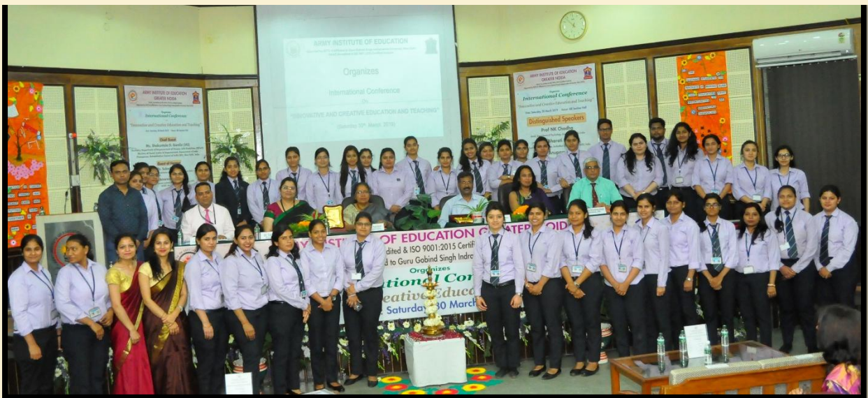
Group Photograph of Students AIE with Dignitaries

The programme concluded with photo session and evening tea for all.