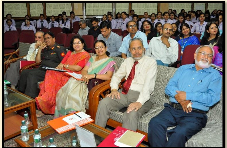
Distinguished guests & Principal of APS Shankar Vihar & Noida