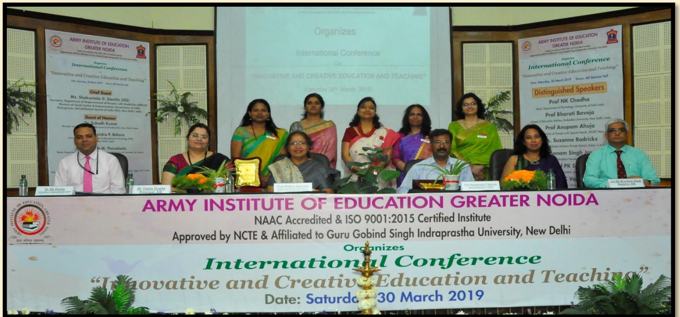
Group Photograph of faculty AIE with Dignitaries