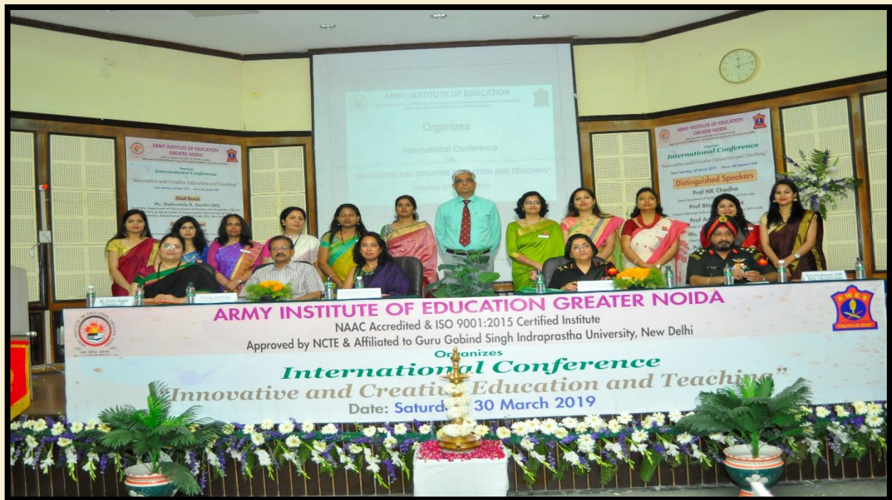
Group photograph with the esteemed dignitaries & faculty AIE