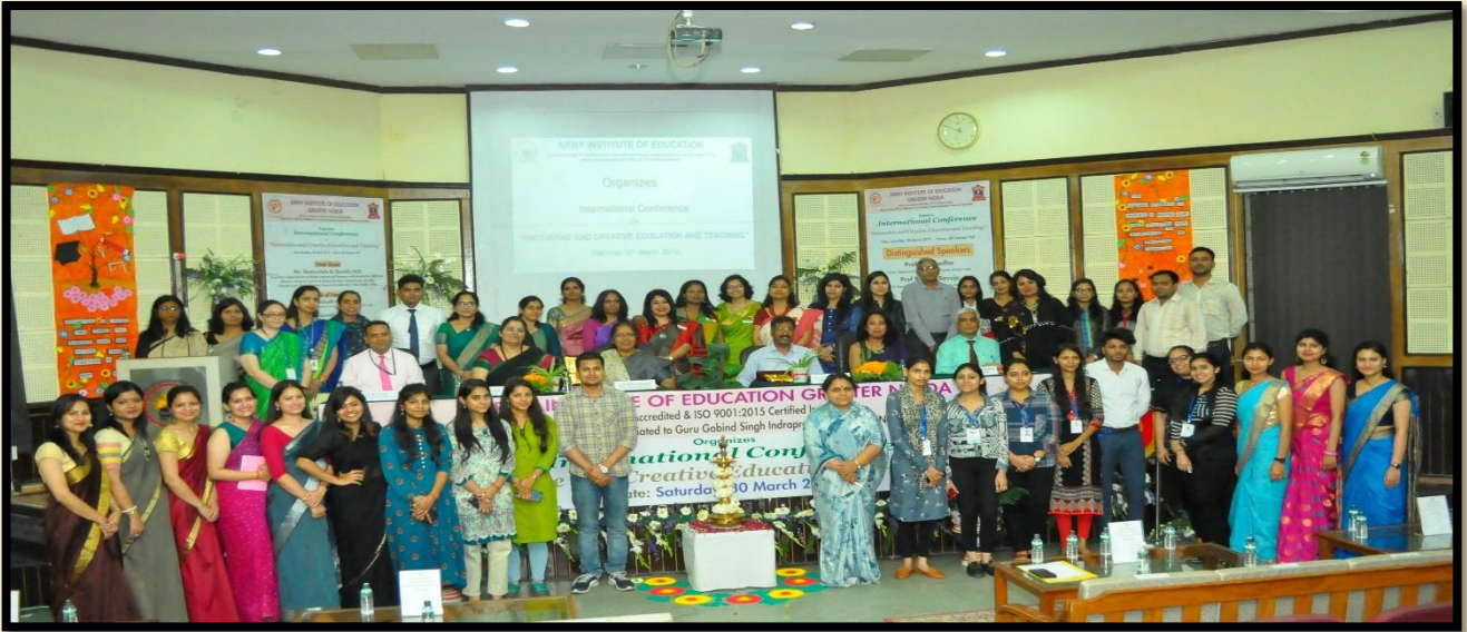
Group Photograph with Participants